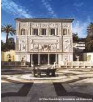
Pontifical Academy of Sciences

The claim that science is the only way to truth is a claim ultimately unworthy of science itself. Nobel Laureate Sir Peter Medawar points this out in his excellent book, Advice to a Young Scientist : ‘There is no quicker way for a scientist to bring discredit upon himself and upon his profession than roundly declare—particularly when no declaration of any kind is called for—that science knows, or soon will know, the answers to all questions worth asking, and that questions which do not admit a scientific answer are in some way non-questions or pseudo-questions that only simpletons ask and only the gullible profess to be able to answer.... The existence of a limit to science is however, made clear by its inability to answer childlike elementary questions having to do with first and last things—questions such as: “How did everything begin?”; “What are we here for?”; “What is the point of living?”’ 1