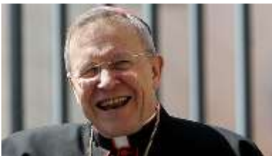
Cardinal Walter Kasper

I am very astonished that the scientific picture of the real world around me is very deficient. It gives us a lot of factual information, puts all of our experience in a magnificently consistent order, but it is ghastly silent about all and sundry that is really near to our heart that really matters to us. It cannot tell us a word about red and blue, bitter and sweet, physical pain and physical delight; it knows nothing of beautiful and ugly, good or bad, God and eternity. Science sometimes pretends to answer questions in these domains but the answers are very often so silly that we are not inclined to take them seriously. 8