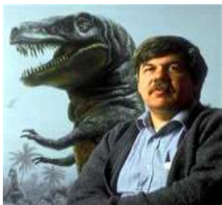
(Stephen Jay Gould)

The late Stephen Jay Gould, former Professor of Paleontology at Harvard University addresses his fellow scientists about God in this way: